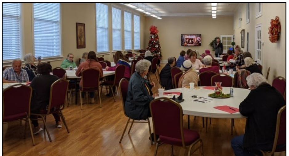
Attendees of the SGRC-AAA Public Hearing at the Bacon County