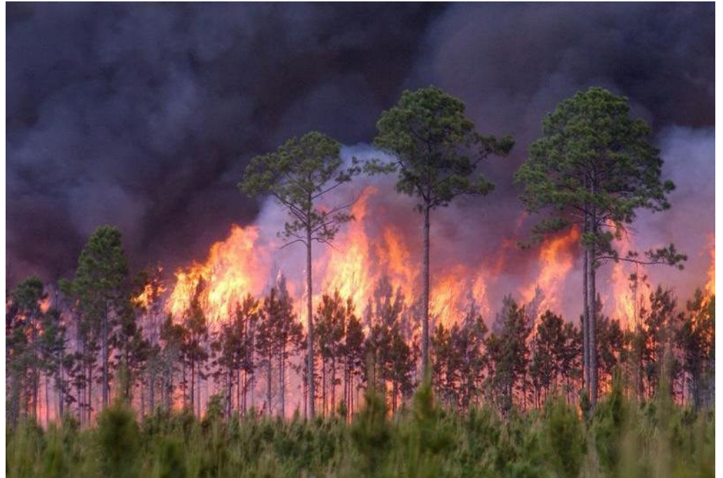
Wildfire roars through the treetops of pines in Ware County , 2007

Due to a rise in the number and severity of hazardous natural events, the State of Georgia is committed, now more than ever, to reducing the devastating impact of natural hazard events to its citizens. Because of the potential in Georgia to experience a wide range of natural disasters, the Georgia Emergency Management and Homeland Security Agency (GEMA/HS) promotes the concept of hazard mitigation planning. Each county in Georgia is required by the GEMA and the Federal government to maintain a current Hazard Mitigation Plan, which has a five-year lifespan. In the Southern Georgia Regional Commission (SGRC) region, Planning