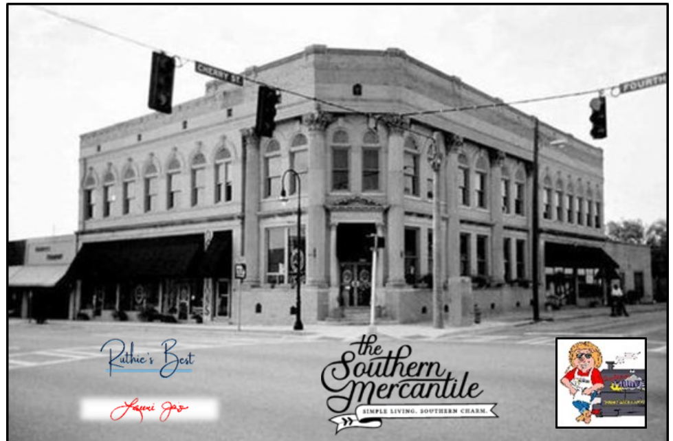
Fourth & Cherry Foods in Ocilla